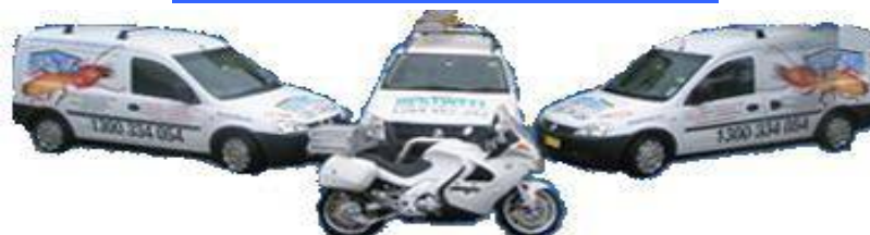
Sample 2 Storey House