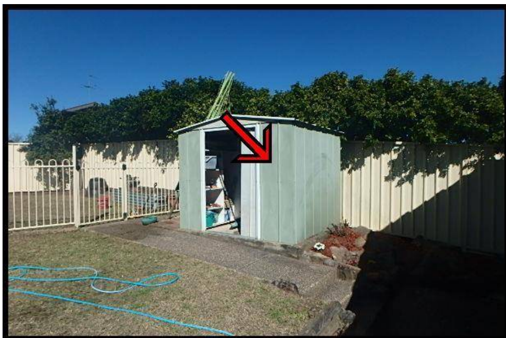
Metal garden shed: