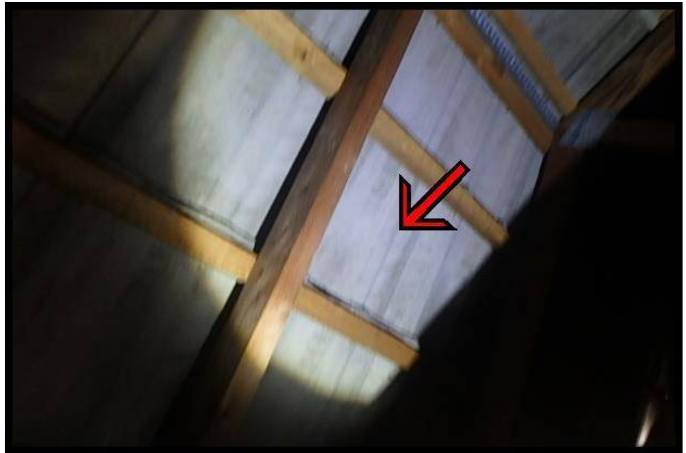
There is no sarking membrane present in the roof area.