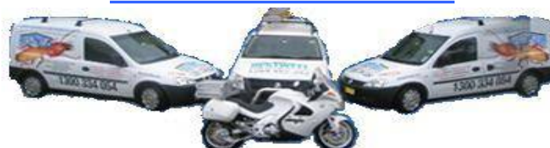
Sample 2 Storey Duplex