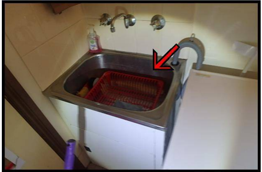
The tub and taps appear serviceable.

Important Notes: In regard to plumbing or electrical, it should be noted that we are not plumbers or electricians and any comment made is not that of a qualified plumber or electrician. We recommend that a qualified contractor be engaged to make comment on any matter dealing with plumbing or electrical issues.